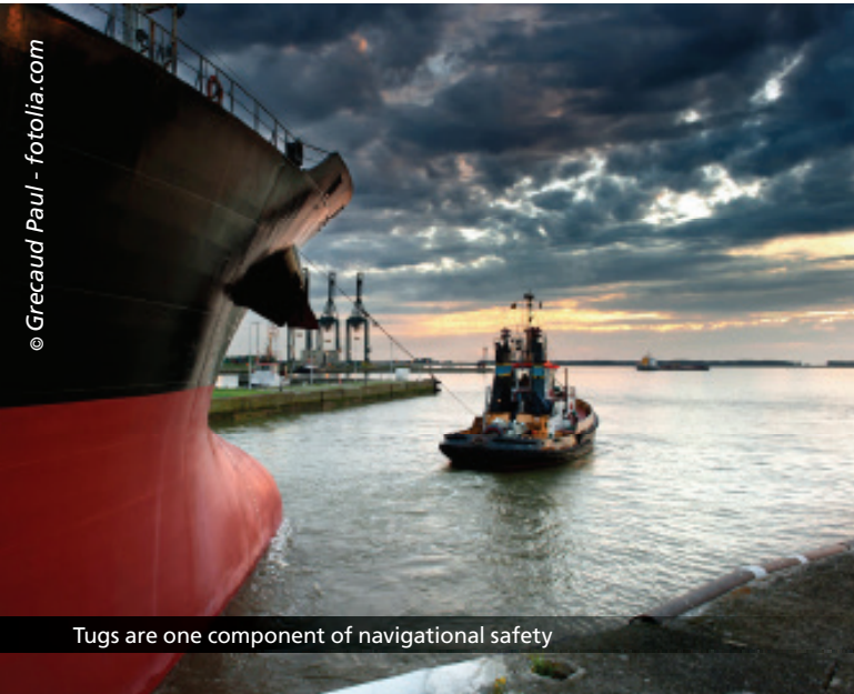
Tugs are one component of navigational safety