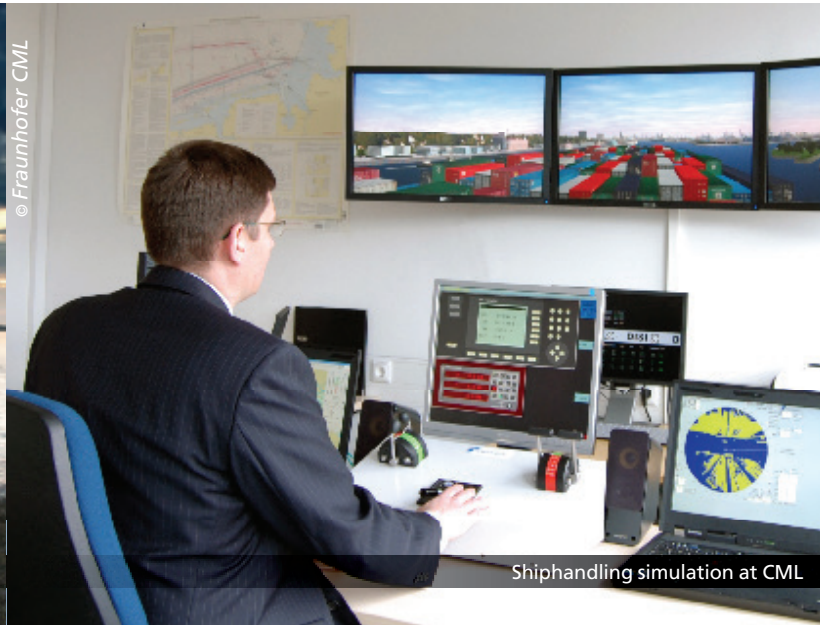
Shiphandling simulation at CML